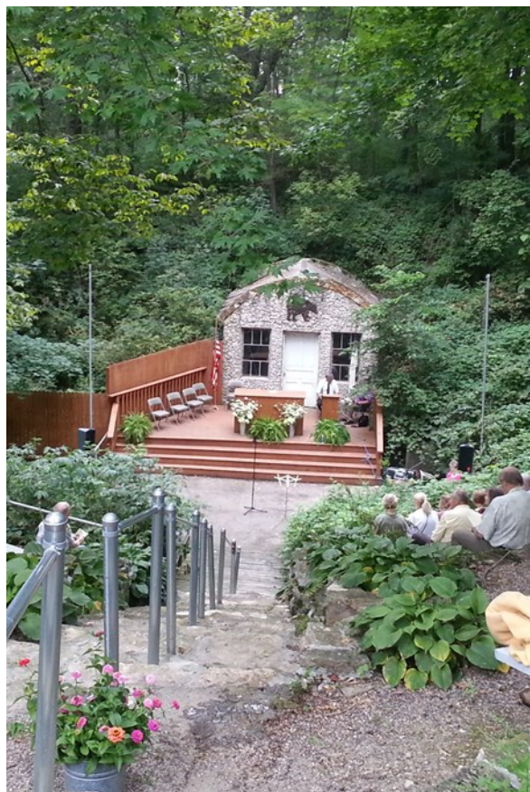
Worship Service in “The Bowl”