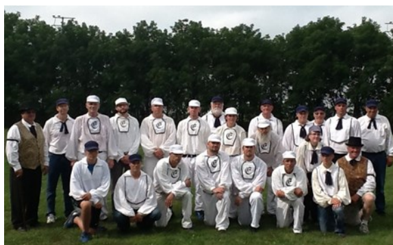
Elstad-Highland Prairie Hayseeds Vintage Baseball Team

LUNCH FOLLOWING WORSHIP (free will donation)